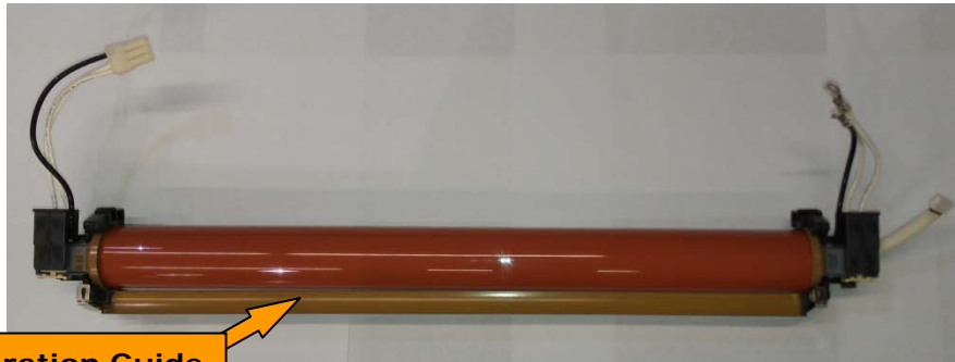
Fixing Separation Guide

The element and its housing are very fragile; please use special care when locking these connectors in place. Failure to fully seat and lock both connectors on the film unit will result in poor contact. This can cause an immediate E003 after install or cause the element to eventually arc and destroy the film unit!